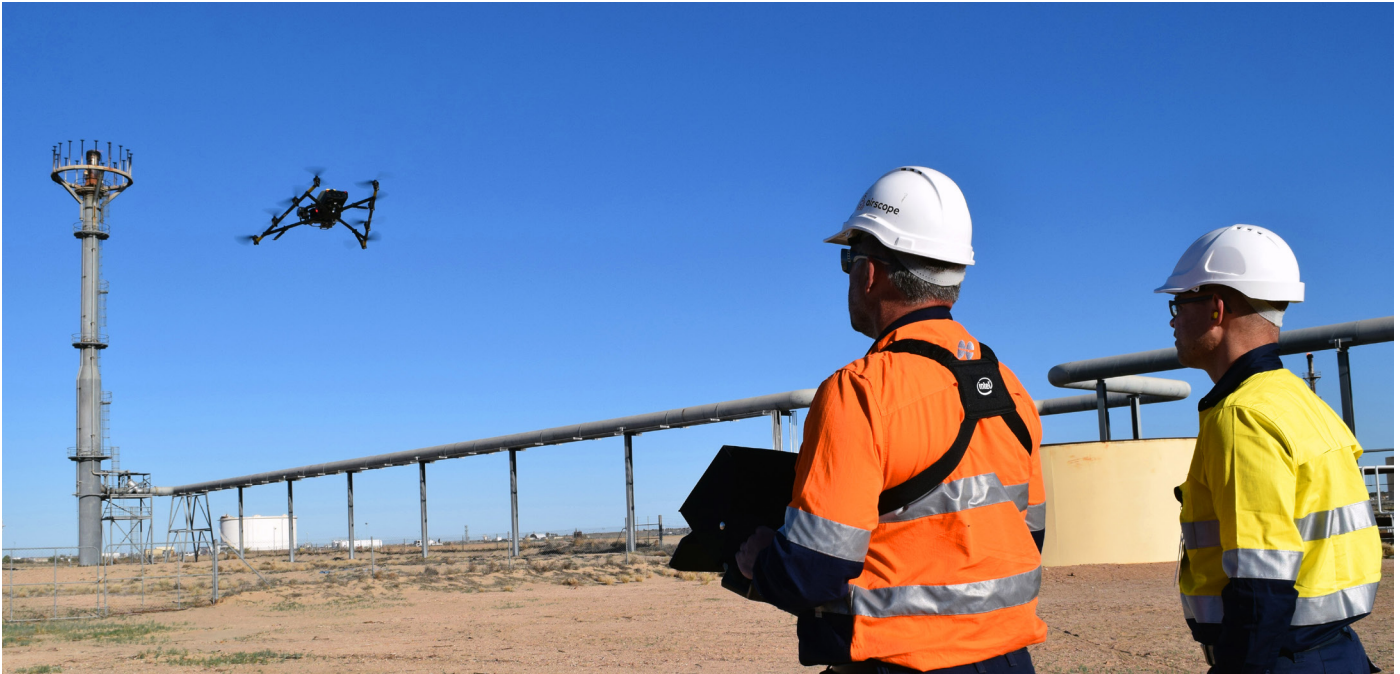
Image of the Intel® Falcon™ 8+ drone being deployed at the Moomba Plant, South Australia.