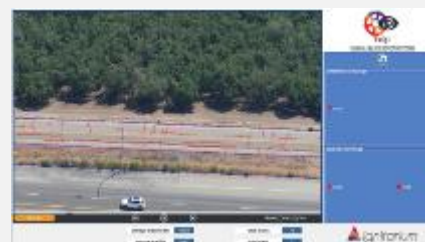
Road Surface Inspection