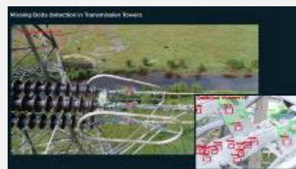
Transmission Tower Inspection