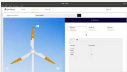
Wind Turbine Inspection