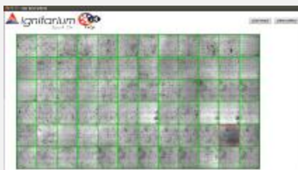
Solar Panel Inspection