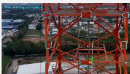
Telecom Tower Inspection