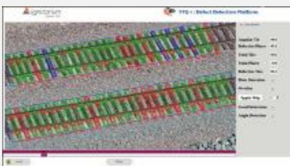
Rail Track Inspection

What started as a defect detection solution for manufacturing, has evolved to focus on improving inspection of rail tracks, telecom towers, transmission towers, wind turbines, solar farms, and roads.